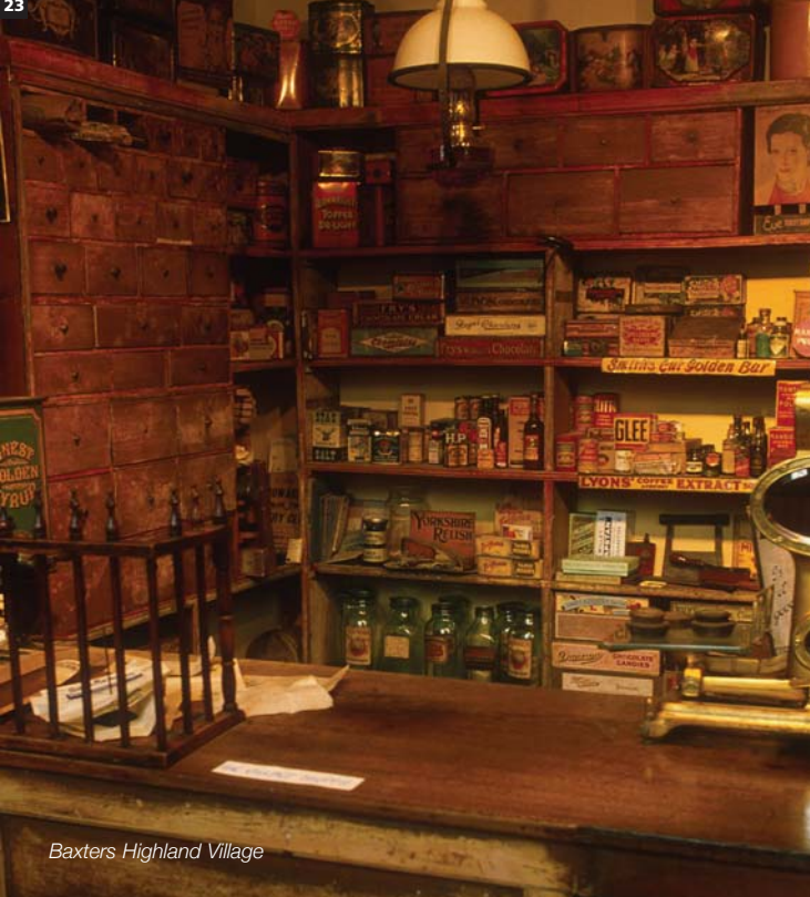
Baxters Highland Village

24. Discover how the different elements of Scottish life affect the taste of a whisky. Each distillery produces different tasting malts, while taking influences from their surroundings and using different distilling equipment. The Glenlivet Distillery is on the B9008 and has a visitor centre well worth a visit. $ ♿ 📖 WC