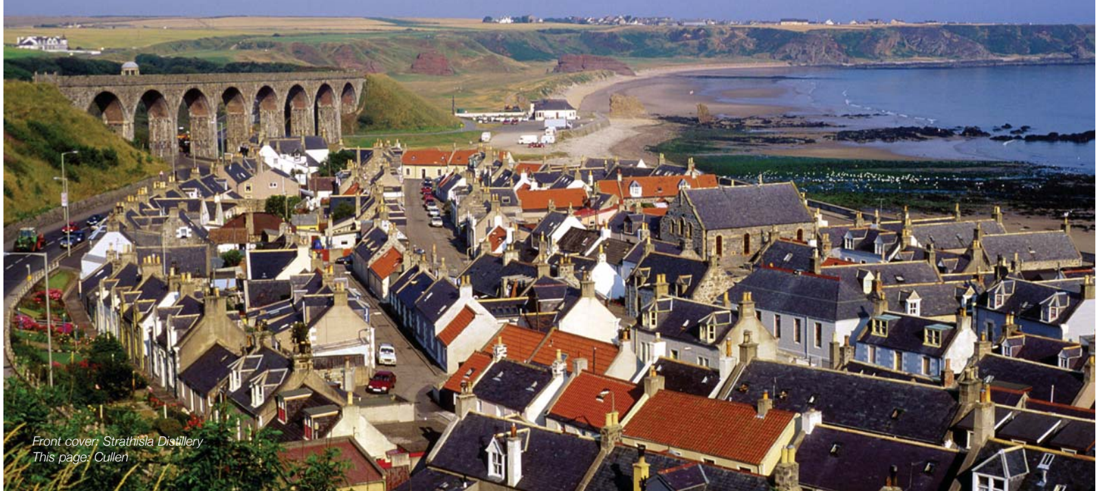
Front cover: Strathisla Distillery This page: Cullen

The very definition of 'off the beaten track', the northeast corner of Scotland casts a spell on first-time visitors that causes them to return time and time again. It could be the unique light which makes the whitewashed fishing villages sparkle alluringly, the tempting array of single malt whiskies which seem to stem organically from the heather-strewn soil or simply the warmth and welcome of the local people. In this region rich in heritage and traditional culture, you'll soon feel the magic that inspired the film 'Local Hero'.