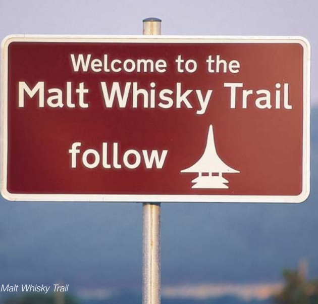
Malt Whisky Trail